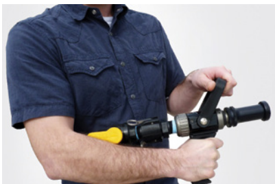
Higher flow foam gun.