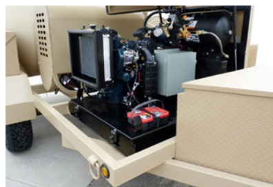
Runs on JP-8 or diesel.